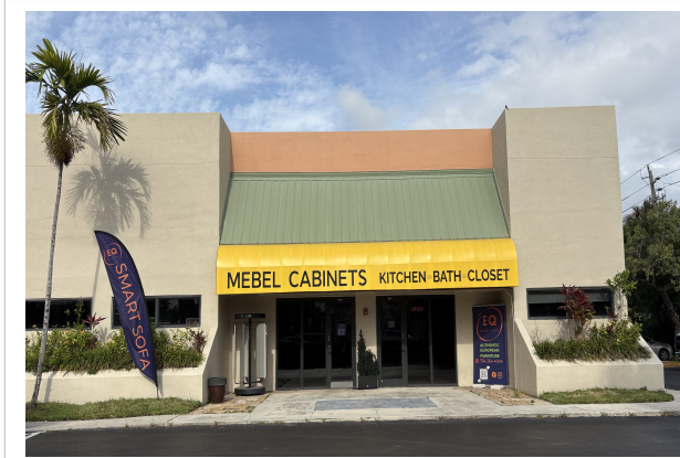
Mebel Cabinets LLC

The following photographs document the current condition of each tenant facade along the Powerline Road frontage. All existing signage is legally established and in good condition.