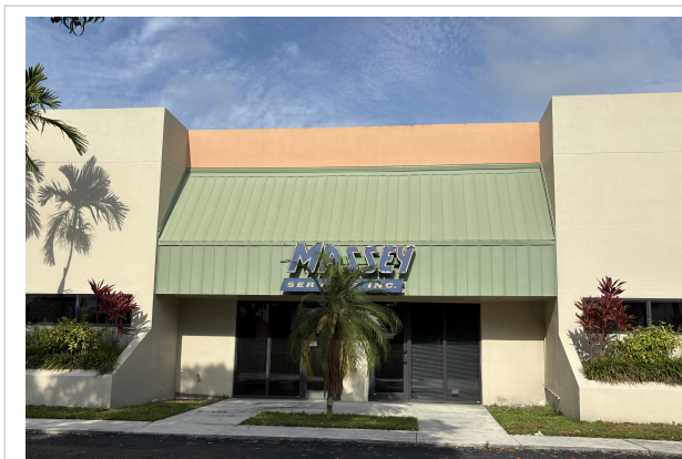
Massey Services Inc