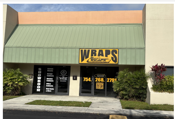
Mobile Wraps & Signs Inc