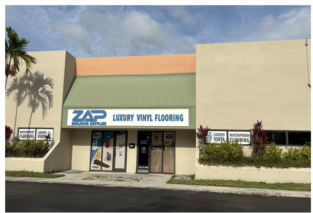
ZAP Supplies LLC