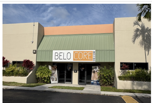
Belocore Floors LLC