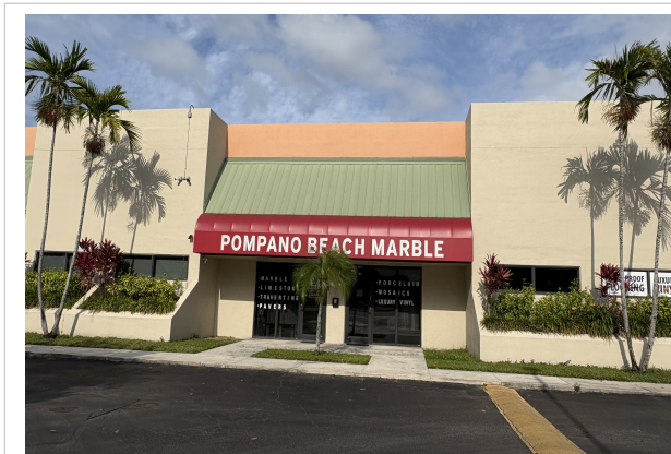
Pompano Beach Marble